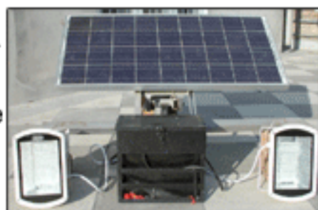
CPL Solar Billboard System